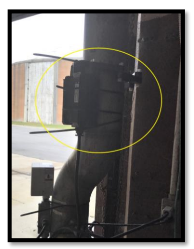
Figure 3: Location of the installation point and pipe bypass (left) and installed HydroFLOW device (right)