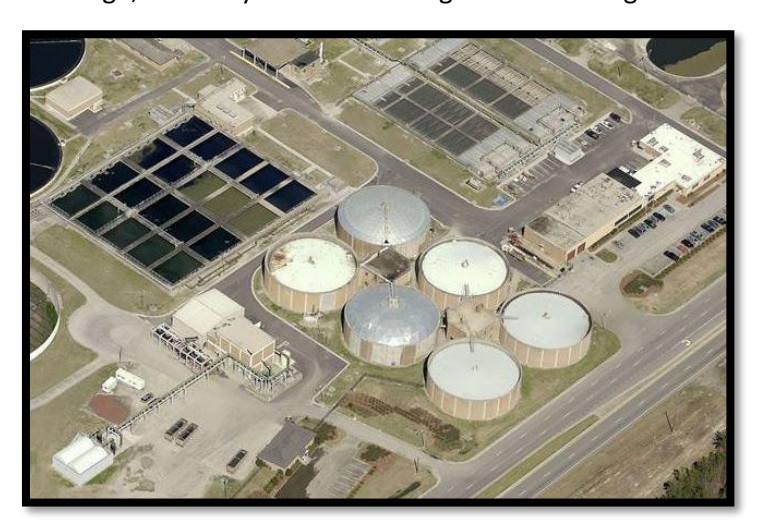
Figure 2: The J. B. Messerly Water Pollution Control Plant

The WPCP (see Figure 2) is one of four wastewater treatment plants that serve the City of Augusta's service population. It is managed, operated, and maintained by the City's Water and Sewer Department. The WPCP, designed for 46 mgd, currently treats an average flow of 20 mgd.