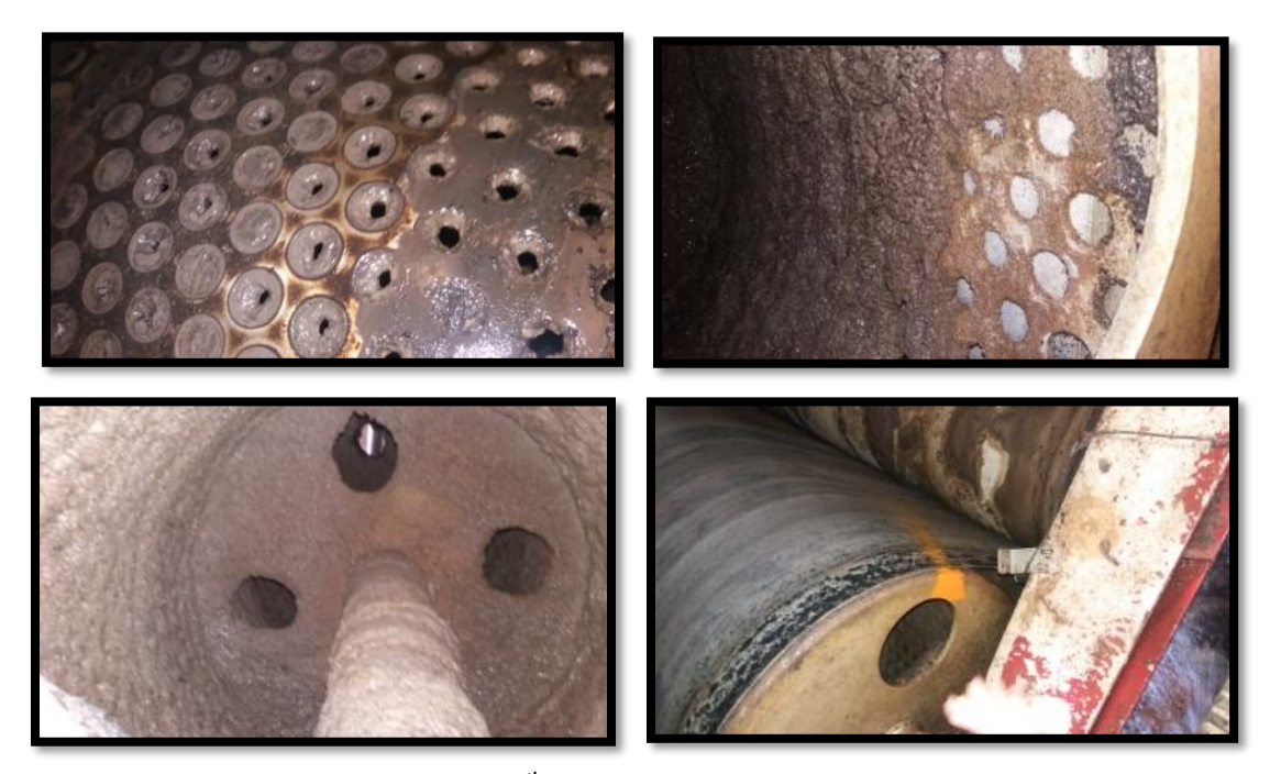
Figure 4: Baseline condition on 7<sup>th</sup> September 2017 before Hydro FLOW was activated

Before energizing the Hydro FLOW unit, several pictures were taken to establish baseline condition. As shown in the Figure 4 below, heavy struvite encrustation was evident on the drum surface. Other parts of the BFP also showed struvite scale accumulation.