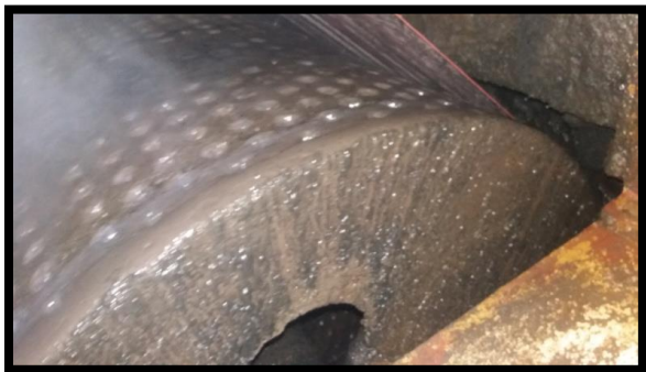
Figure 5: Final condition on 1st March 2018

In addition to test observations, it is also important to note anecdotal information concerning the operators experience using HydroFLOW: