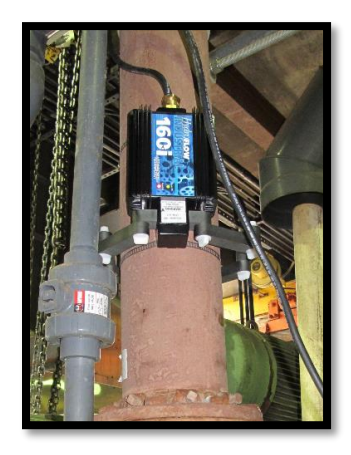
Figure 1: Installed HydroFLOW unit (Model 160i) at a wastewater treatment plant

The HydroFLOW I Range is powered by the patented Hydropath technology. When properly installed on a pipe (see Figure 1), it induces a 150 kilohertz, oscillating sine wave, alternating current (AC) signal. The electric induction is performed by a special transducer connected to a ring of ferrites. The pipe and the flowing fluid act as a conduit, which allows the signal to propagate. The induced AC signal is believed to cause the mineral ions that make up struvite (magnesium, ammonium, and phosphate) to form loosely held together clusters. When certain conditions are created (e.g., pressure change, temperature change, and turbulence) the clusters precipitate out of solution and form stable crystals of struvite that remain in suspension. The crystals are not able to adhere to surfaces as hard scale and are carried away with the flow. Because hard scale no longer accumulates, the shear forces created by the flowing liquid erode and soften existing scale deposits over time. It is important to note that constant liquid flow is required to remove hard scale deposits from a system.